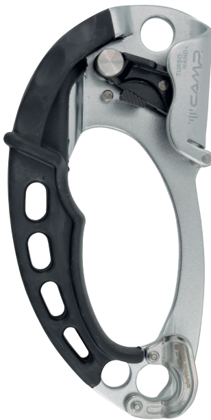
Turbohand Left - Ref.2634-L2 + Turbohand Guide Left - Ref.0966 L