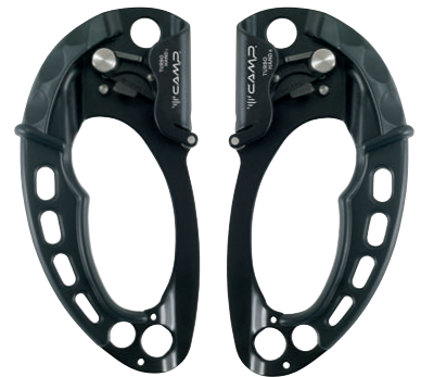
263401-L8 Black Left