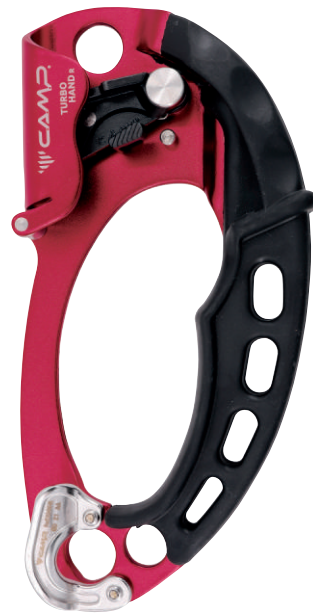
Turbohand Right - Ref.2634-R1 + Turbohand Guide Right - Ref.0966 R